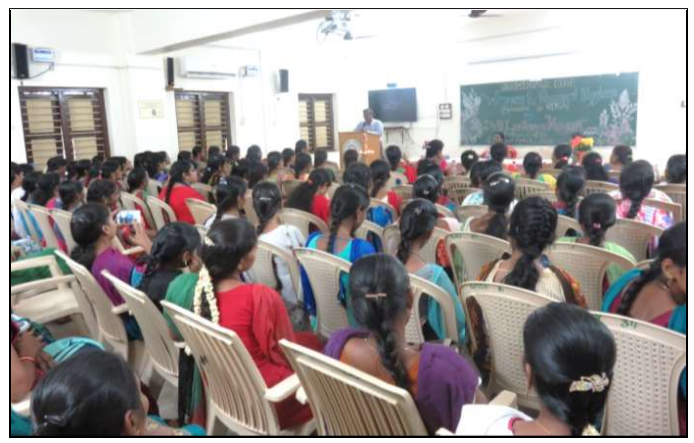
Annual Gender Sensitization Plan