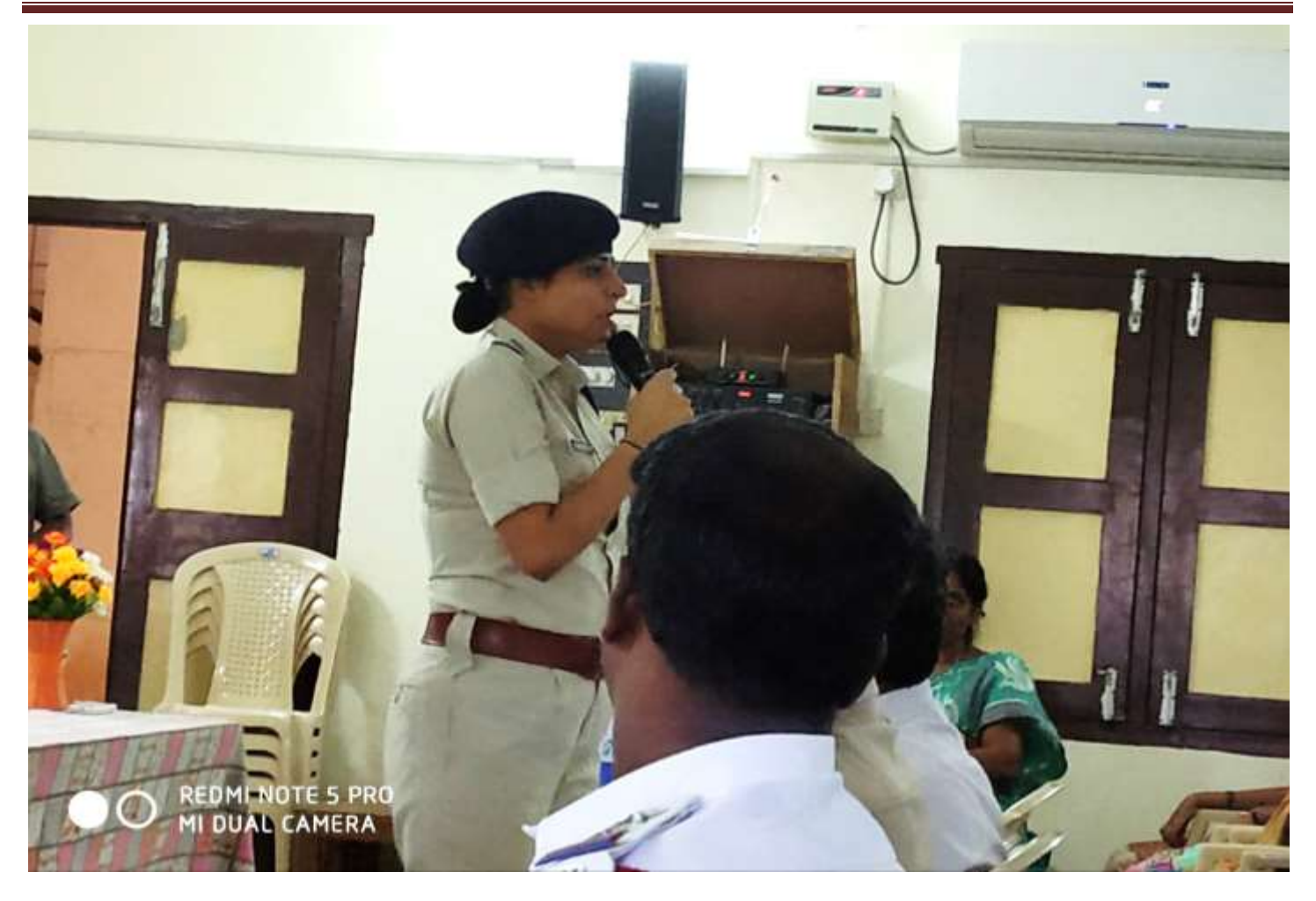
4. Lecture on Provisions against Sexual Harassment on the occasion of International Women's Day 2019: