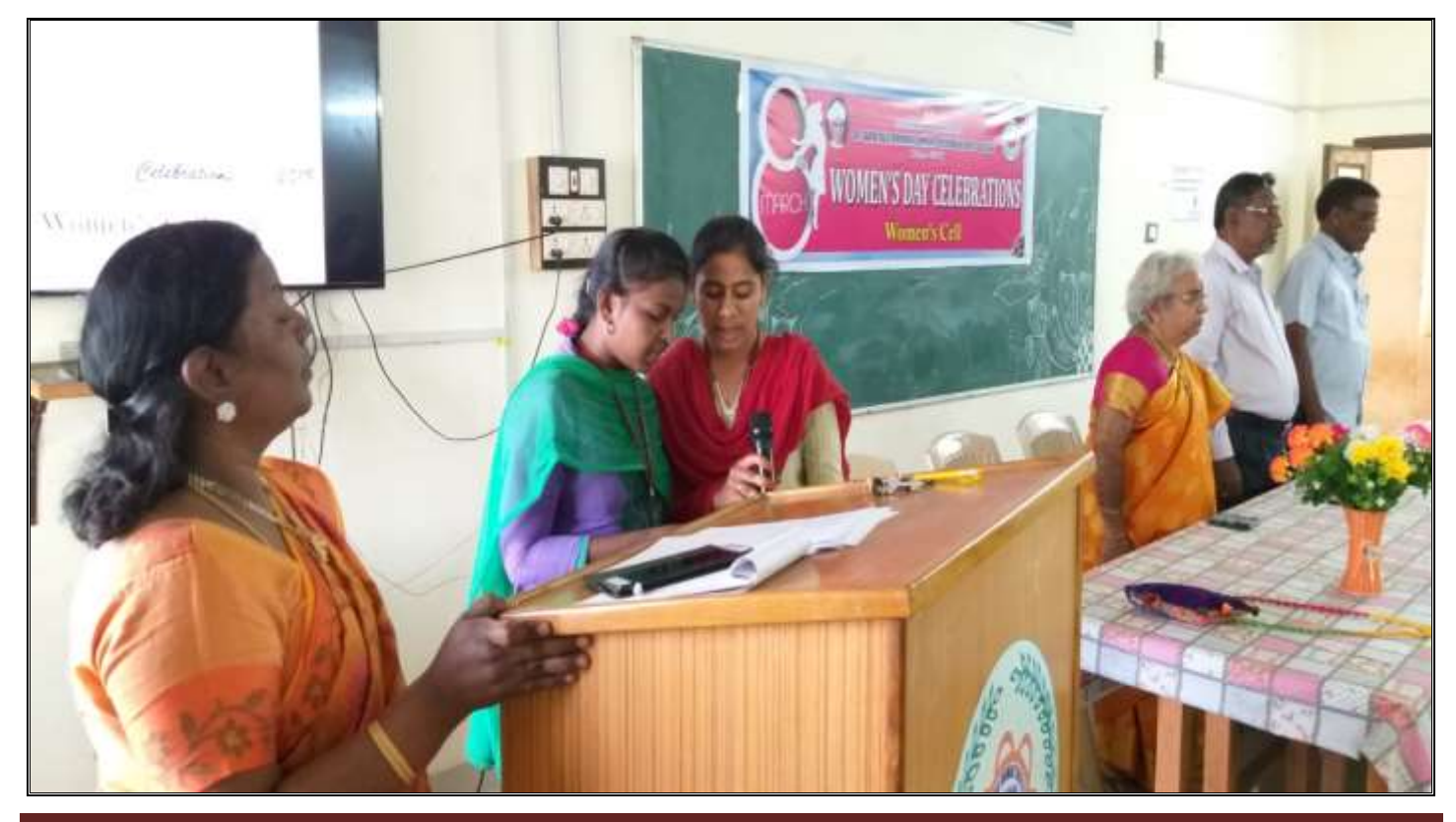
7.1.1. Gender Equity